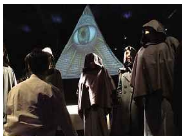
56 PULLING THE COSMIC TRIGGER Bringing Discordian drama to the stage