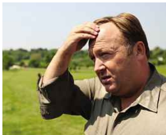
5 THE REAL ALEX JONES Conspiracy theorist or dead comedian?