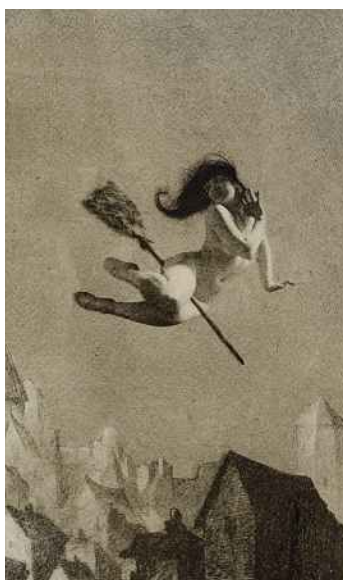
6 AMERICAN GROTESQUE The photographs of William Mortensen