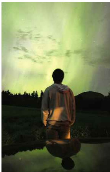
40 I SING THE MIND ELECTRIC Electromagnetic near-death experiences