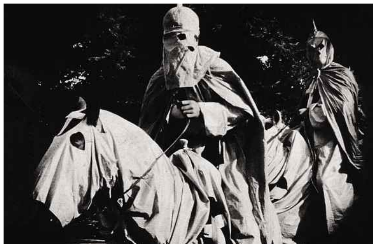
34 GHOSTS OF THE AMERICAN SOUTH Superstition, slavery and social control